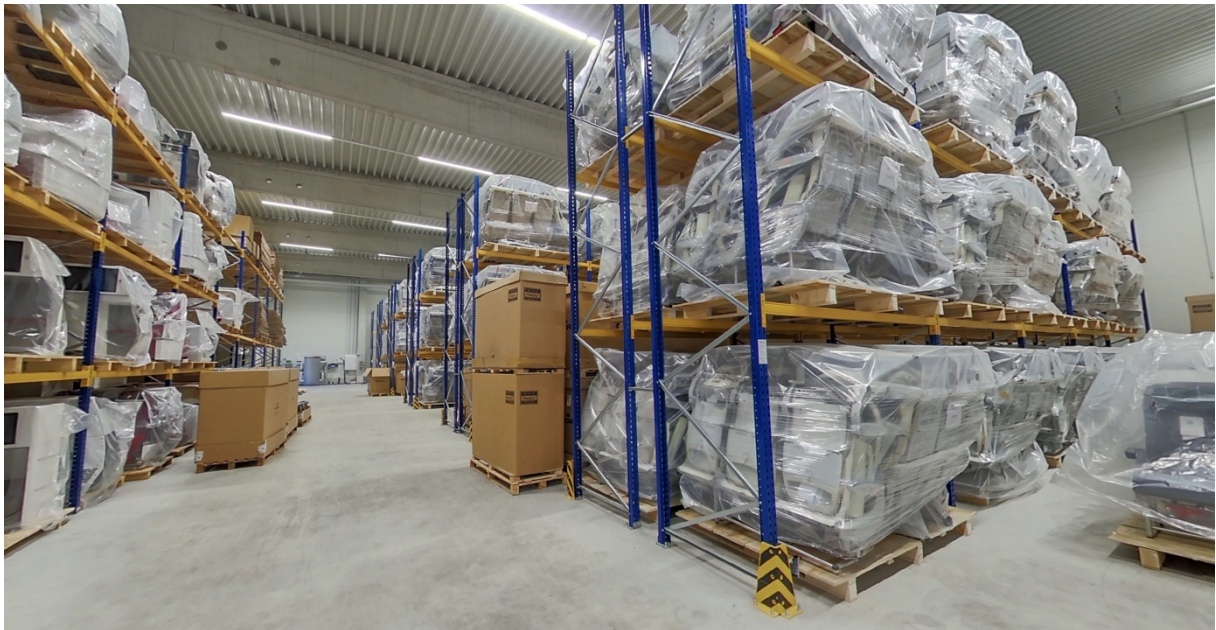
The new high-rack warehouse was completed by the end of November 2023.